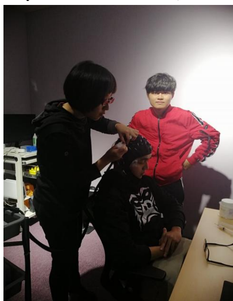
Picture 1. Injecting the conductive cream

Next, we must squirt a small amount of conductive cream into the small opening in the top of each electrode disc to help in the flow of the electrical activity of the brain. This may seem a bit scary to some since we must use a syringe to squirt in the lotion, but the syringe is only for squirting purposes. We use a blunt tipped needle attached to the end of the syringe, but once again the needle is blunt with no sharpness to it and has to be used because the hole is very small. It is harmless! (See Picture 1)