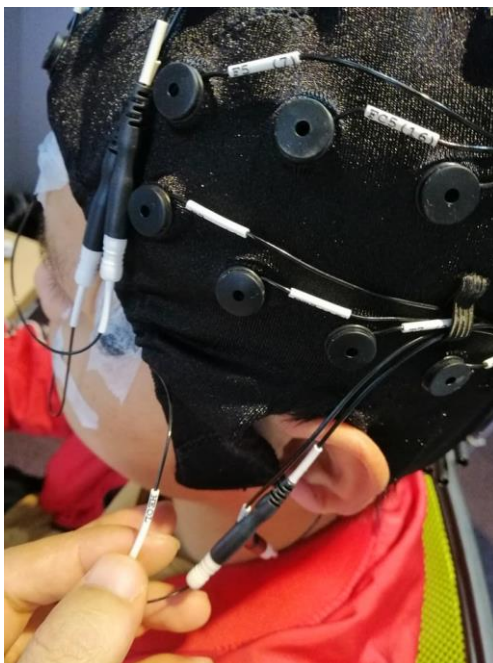
Picture 2. The completed scalp with conductive cream

Step 7. After all this preparation, we are now ready to run the EEG. The room will be made dark, quiet, and door closed to promote relaxation. The tech will tell you everything that will happen before it is performed (on the screen). Just make sure you are relaxed and ready.