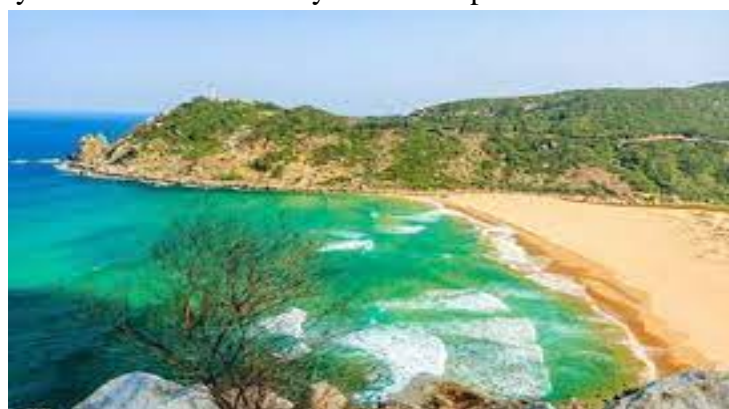
Picture 4. Dai Lanh cape – The easternmost point on the mainland of Vietnam

Linking marine tourism exploitation with other types of tourism has not been done well. Besides, the planning and development of marine tourism have not been given due attention; the participation of the local community is still spontaneous; security and defense issues and the impact of climate change has unpredictable effects on the development of marine tourism. Phu Yen is one of the localities that often suffers from natural disasters, especially storms, and floods. Located adjacent to the sea, it is most affected by storms, tropical depressions, storm surges, and wastes upstream, so the water source is likely to be polluted with high salinity. Some places have lousy quality, causing affect the bathing activities of tourists. Marine resources are also gradually being depleted due to massive fishing activities, which significantly affect the marine ecosystem in the present and the future.