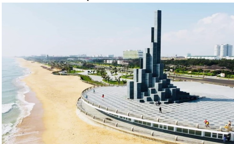
Picture 5. Nghinh Phong tower – New symbol of Phu Yen marine tourism

In the process of applying attention to the specificity of each region, set out appropriate development guidelines and policies for the highest socio-economic efficiency, a harmonious combination between exploitation and conservation of marine tourism resources and high-class tourism services in order to achieve a balance and sustainability in the development of marine tourism space.