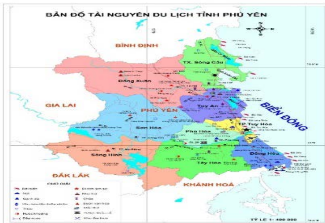
Picture 2. The tourism resources of Phu Yen province

- Intangible cultural tourism resources: Festivals in Phu Yen are quite rich and associated with cultural activities, productive labor of the sea, and long – standing folk traditional craft villages such as fish sauce, salt making, shipbuilding, knitting nets, farming, catching and processing aquatic products. In addition, coastal culinary culture is one of the cultural tourism resources stimulating marine tourism development because all visitors need to enjoy local specialties when traveling.