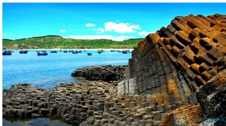
Picture 3. Da Dia reef – Symbol of Phu Yen marine tourism